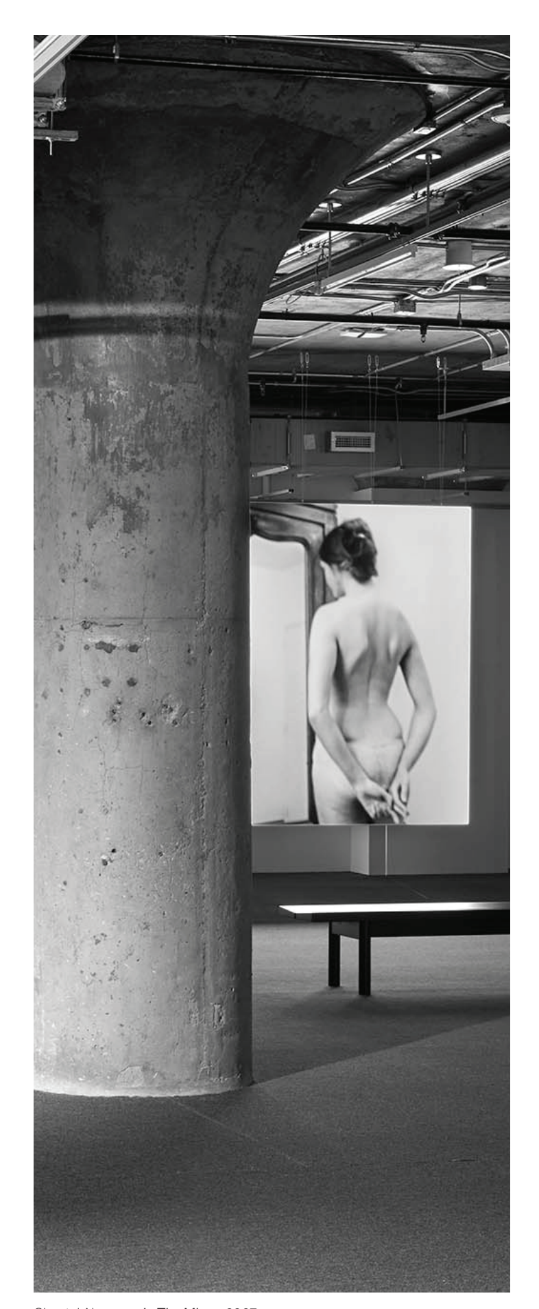
Chantal Akerman. In The Mirror , 2007.