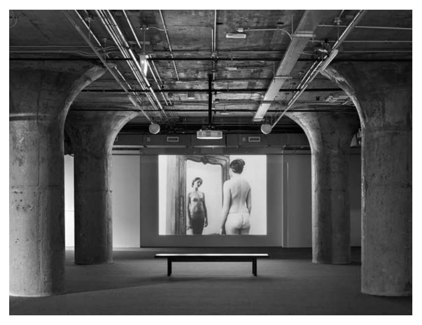
Chantal Akerman, In the Mirror , 2007.

Mark Dion brought a massive, fully grown, deceased tree, along with its inhabitants, to MOCA. Visitors observed and participated in a kind-of autopsy of the tree that unfolded over the exhibition period.