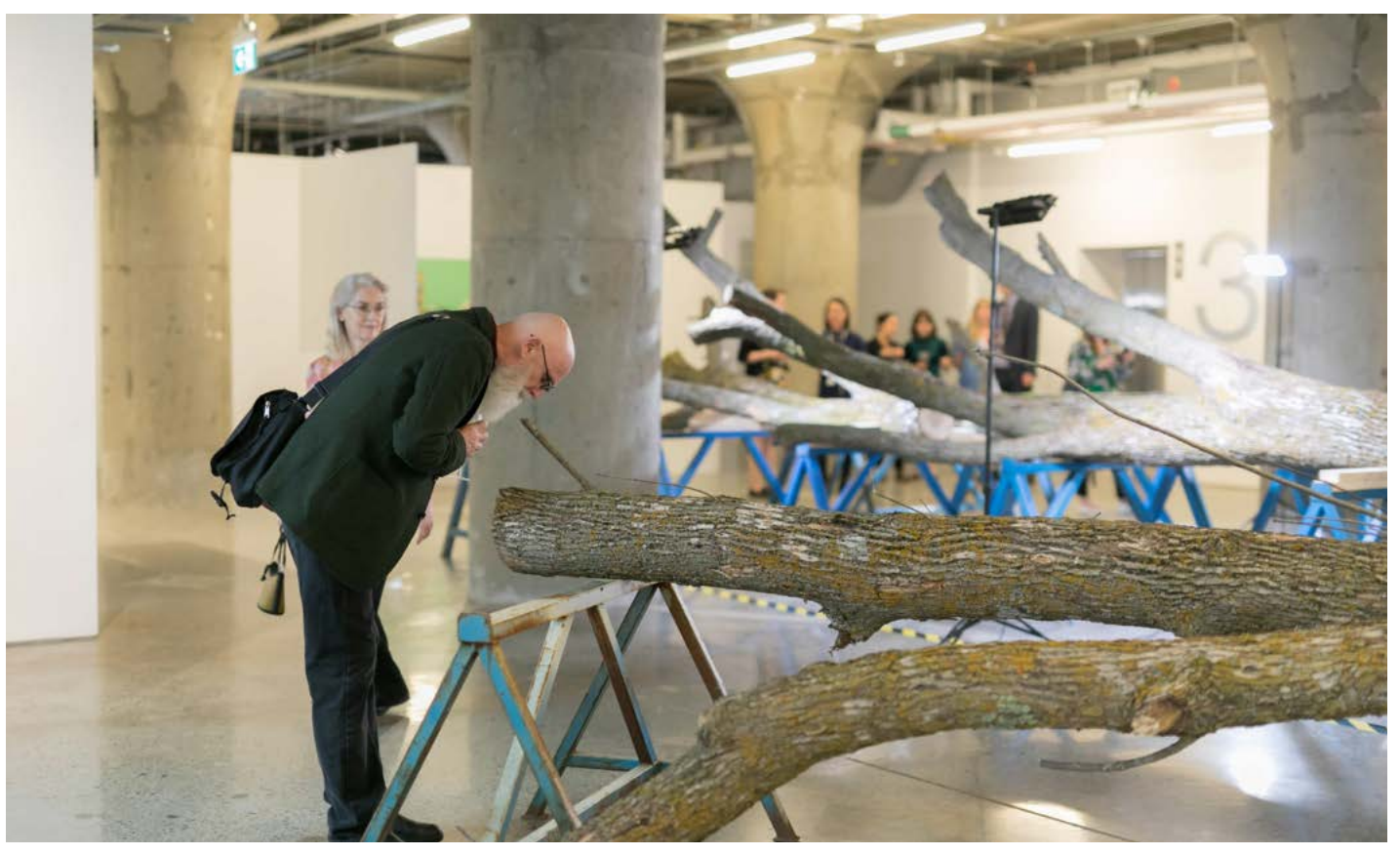
Mark Dion, The Life of a Dead Tree (Installation View), 2019.