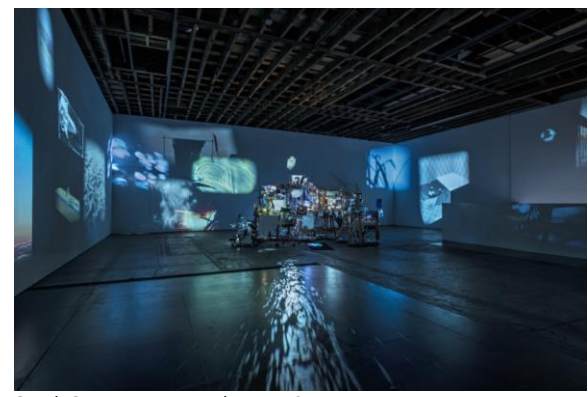
Sarah Sze, Images in Debris, 2018

Simultaneously a sculptural installation and projection tool, Images in Debris lends equal weight to images and objects, exploring the edges between the two and bringing both into dialogue with the surrounding