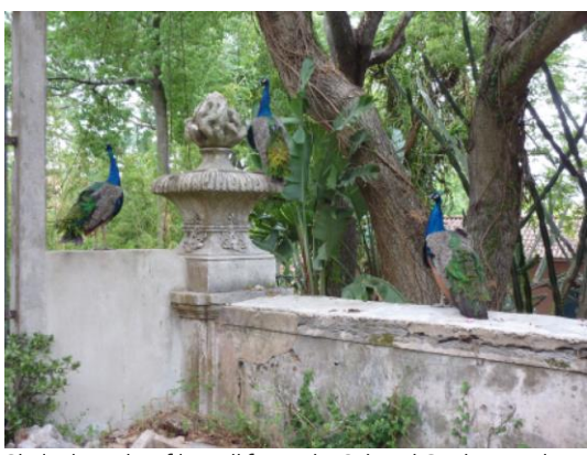
Shelagh Keeley, film still from The Colonial Garden / Jardim do Ultramar Lisbon , 2016

Keeley's MOCA exhibition combines a series of tarp paintings from 1986, a large-scale film projection from 2016, and a new ephemeral wall drawing that she will create on-site over the course of several weeks in January 2020. All three bodies of work are extensions of a conceptual process in which the artist weaves together the past, present, and future. The tarp paintings are shown on the floor and wall, grounding decades of Keeley's practice within the frame of a particular gallery space. In her new wall drawing, Keeley interweaves photographic traces of the building pre-renovation,