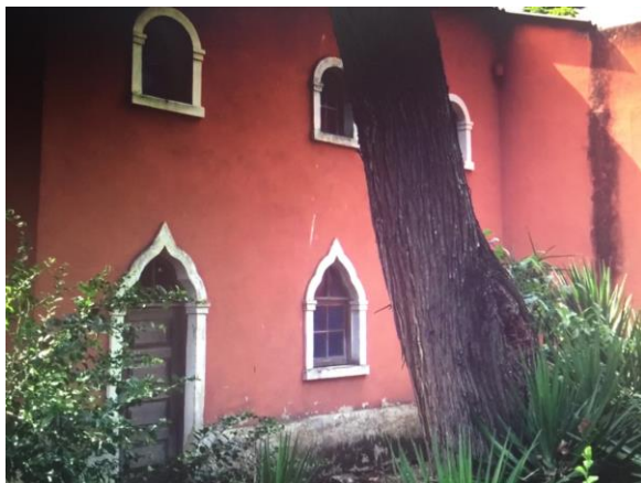
Shelagh Keeley, Film still from The Colonial Garden / Jardim Do Ultramar Lisbon , 2016.

household materials, found objects, stuffed fabrics and paint. HUSH SKY MURMUR HOLE (2020) will be on view February 5–April 12, 2020.