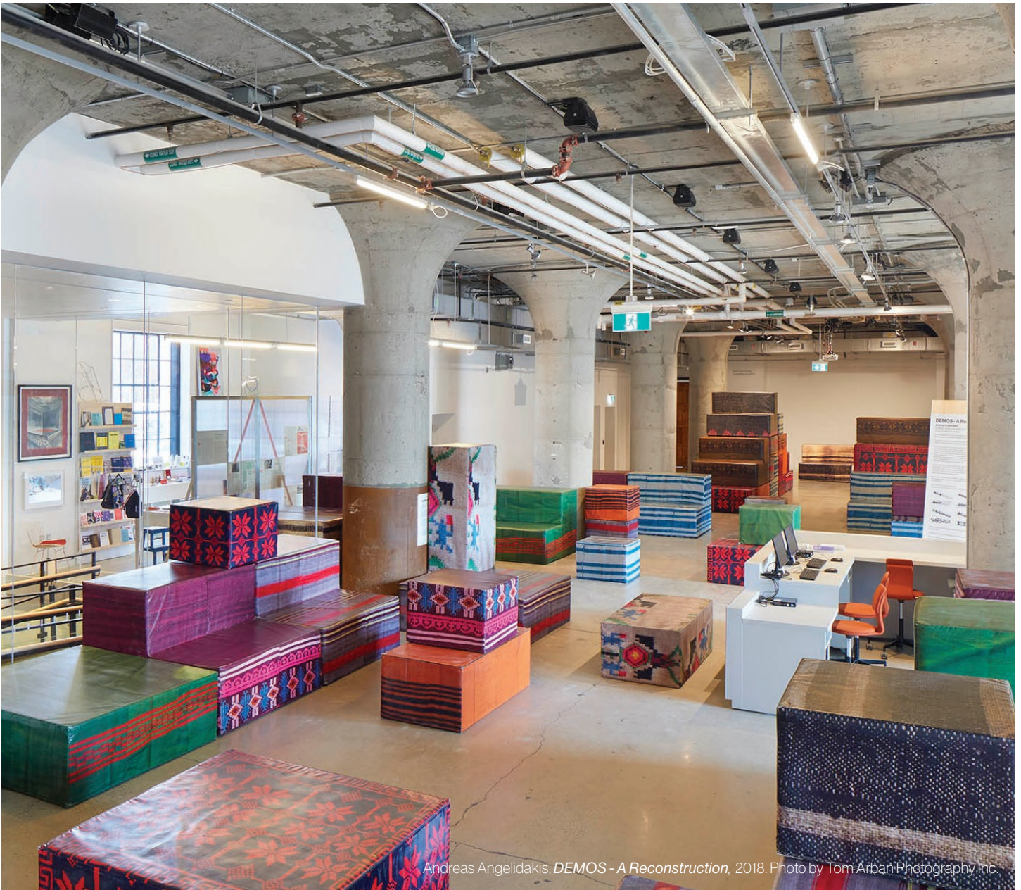
Andreas Angelidakis, DEMOS - A Reconstruction , 2018.