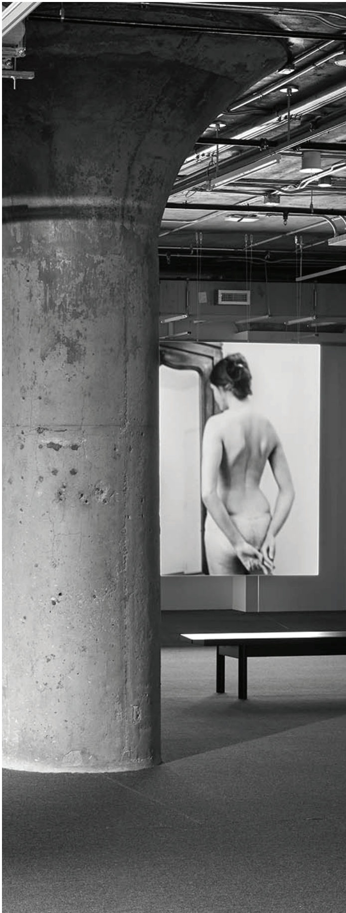
Chantal Akerman. In The Mirror , 2007.